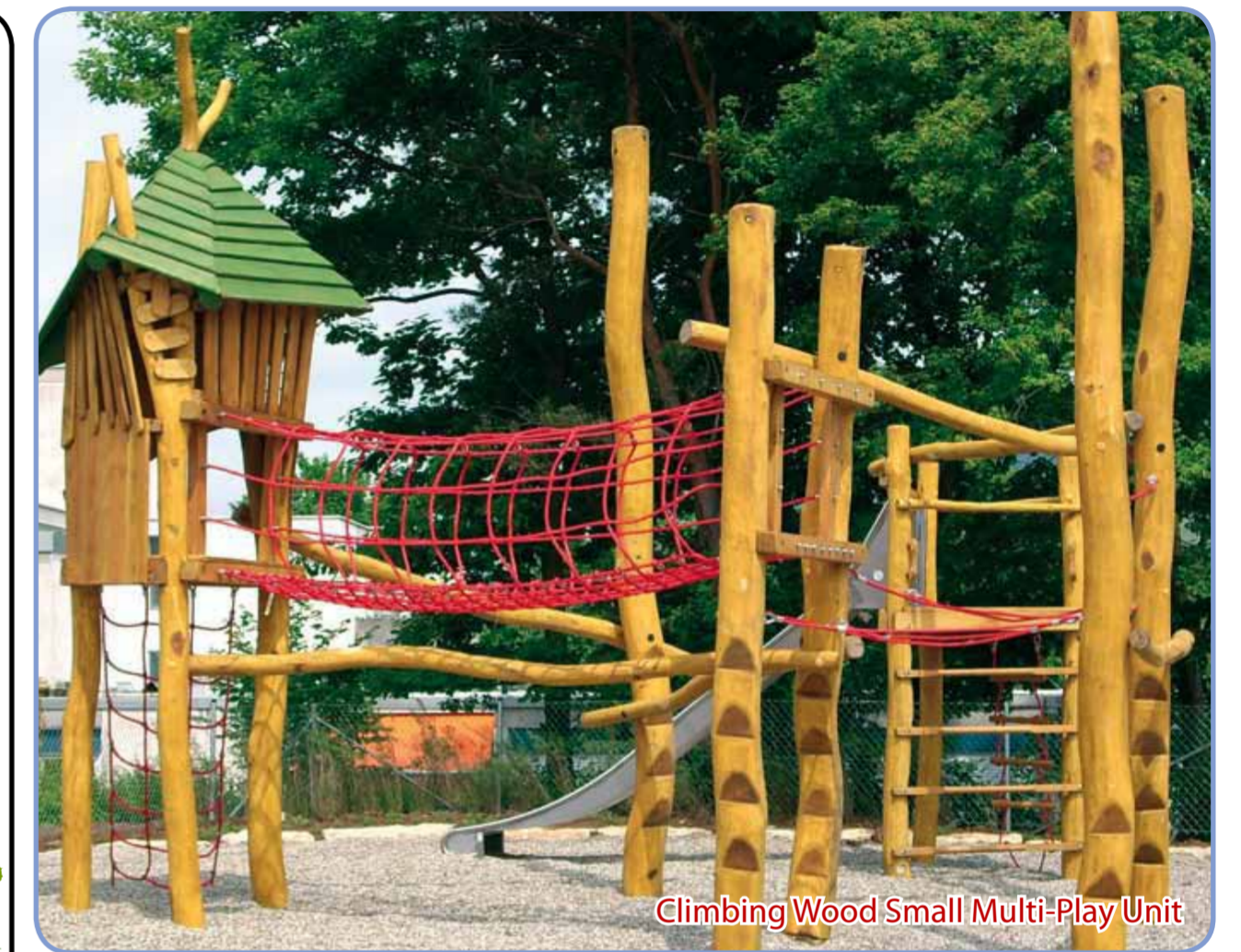
Climbing Wood Small Multi-Play Unit