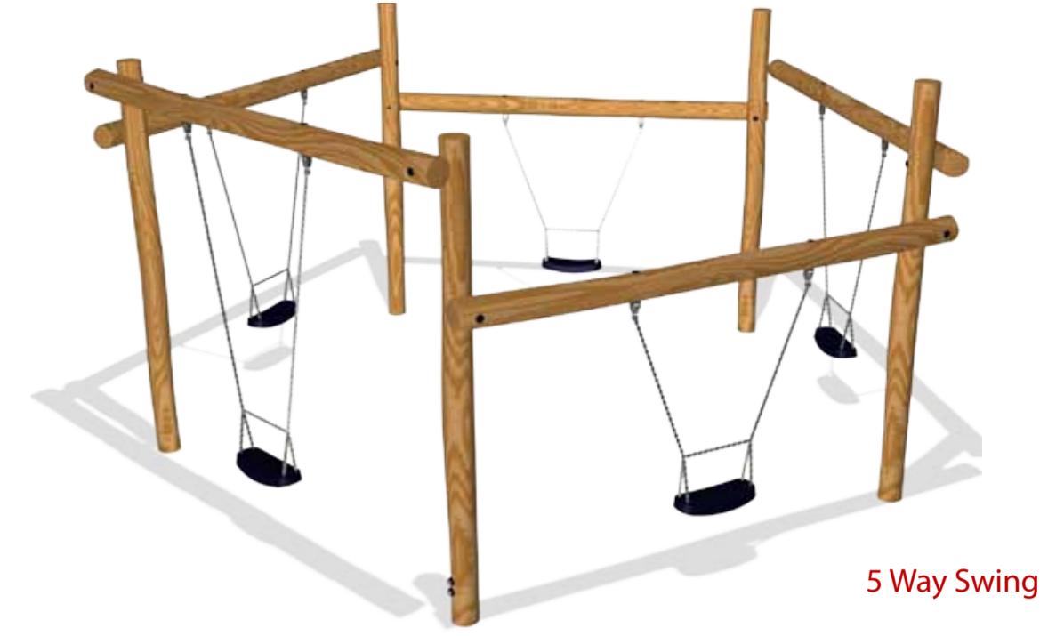
5 Way Swing