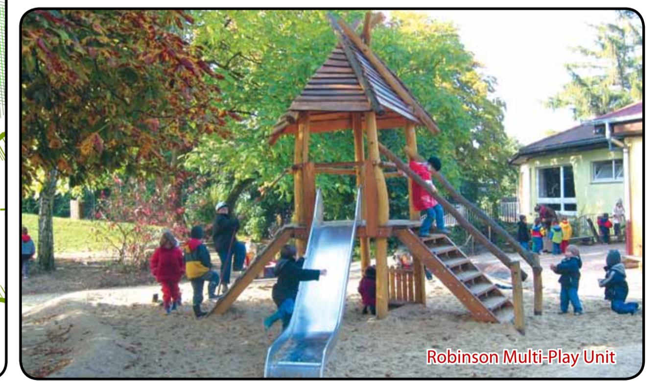
Robinson Multi-Play Unit